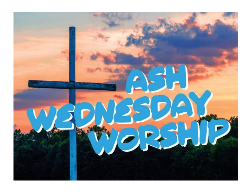
WEDNESDAY, FEBRUARY 17<sup>th</sup> 7:00 pm