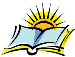
Aubrey Notman Memorial Library