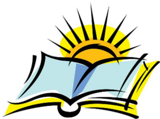
Aubrey Notman Memorial Library

Our Church Library is open every Sunday morning or by calling the church office. Stop by and choose a book!!!